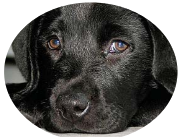
HUTCH is a happy puppy with a special mission in life. Meet him on Page 2.