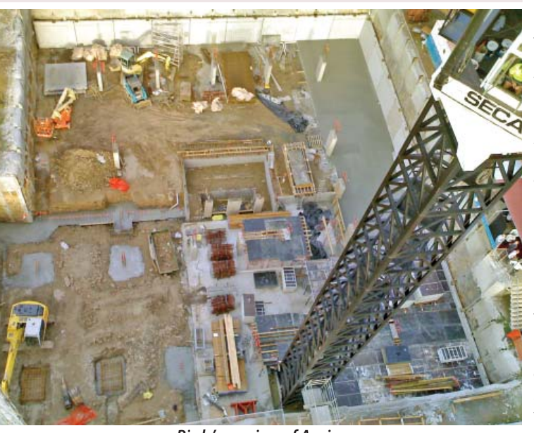
Birds' eye view of Aspire.