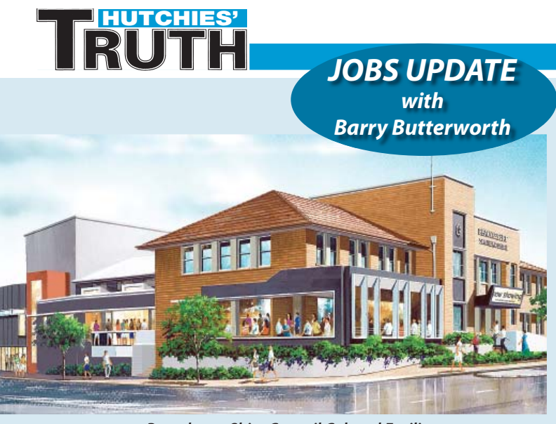
Beaudesert Shire Council Cultural Facility.