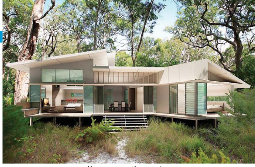
Home among the gum trees.